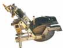
AUTOMATIC LINE MARKING