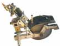
AUTOMATIC LINE MARKING