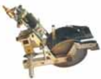
AUTOMATIC LINE MARKING