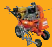
SIBELINE 60 I