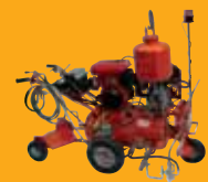
SIBELINE 80 I