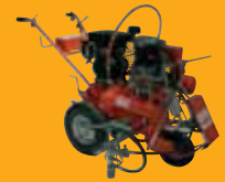
SIBELINE 30 ST