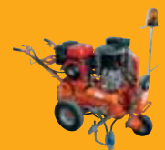
SIBELINE 90 I

CERTIFICATE CE, Sibestar's line marking machines are designed to guarantee both ease of use and professional results. A wide range of accessories is available, such as templates, cones, spray guns for traffic division painting, Trumeter odometers, cotton or nylon twine, etc...).