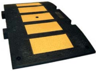
h cm 5 fino a 40 kmh