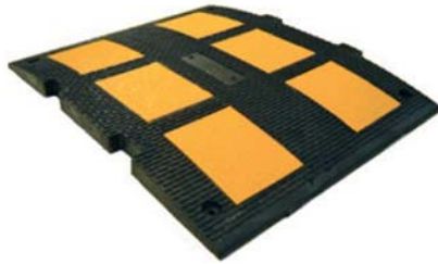
h cm 3 fino a 50 kmh